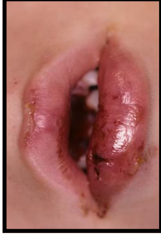
Cut or Bitten Tongue, Lip or Cheek