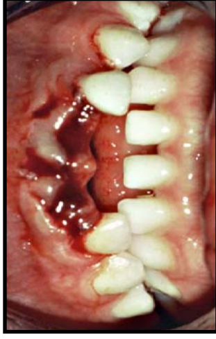
Knocked Out Tooth